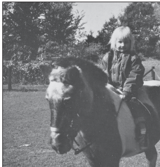
West Lakeland, Minnesota